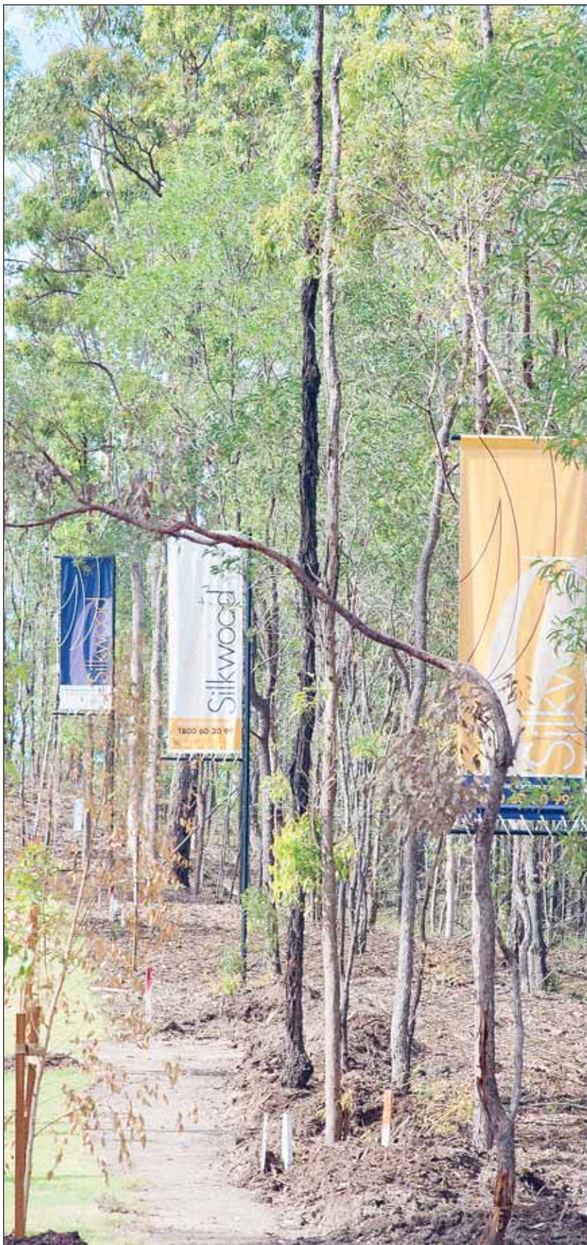
□ Silkwood Mount Cotton is set amidst an abundance of native bushland.