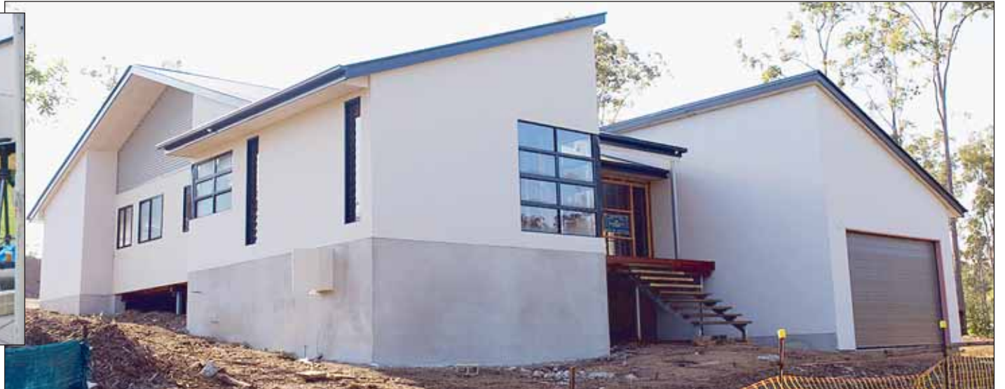
□ The King Gee Jack of All Trades home under construction at Silkwood Mount Cotton.