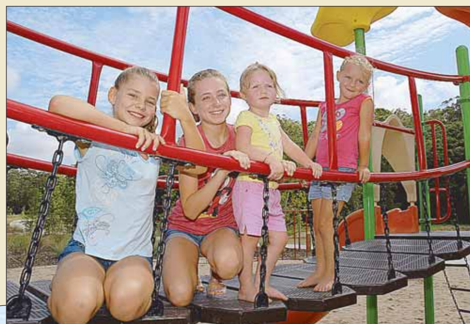
Local thrill seekers enjoying a fast ride in the new Regional Park at Silkwood Mount Cotton.