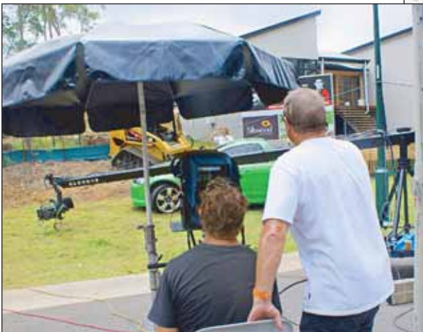
□ Crew filming at Silkwood Mount Cotton.