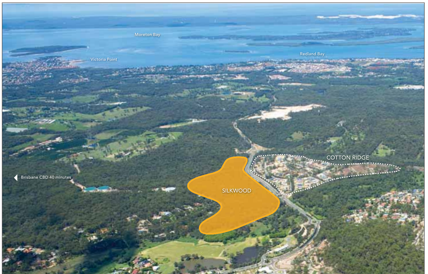
□ This aerial photograph shows Silkwood's close proximity to the bay and wonderful bush locality.