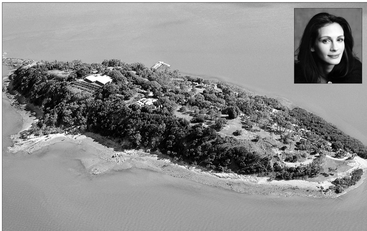
UP FOR GRABS: The luxury Turtle Island retreat, which was made famous by US movie star Julia Roberts (inset).

Or owners could launch their own boat from the jetty, or leave from the helipad.